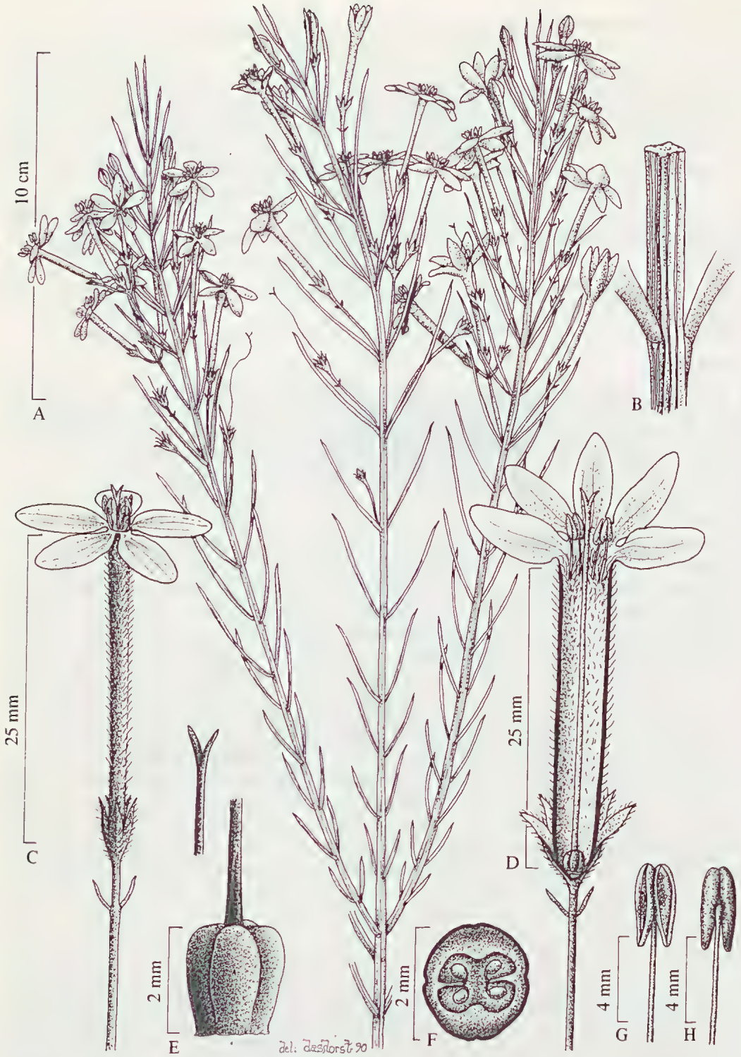
Fig. 1. Huxleya linifolia Ewart & Rees (A-H, N. Byrnes 1282: DNA). A, habit sketch of a flowering branch; B, enlarged portion of tetragonal stem; C, flower with two bracteoles; D, flower with calyx and corolla vertically cut open showing androecium and gynoecium; E, ovary; F, transverse section of ovary; G, stamen showing front view of dehiscent anther; H, stamen showing back view of anther.